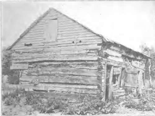
ONLY REMAINING HOUSE ON OREGON TRAIL. (In Washington County, Kansas.)